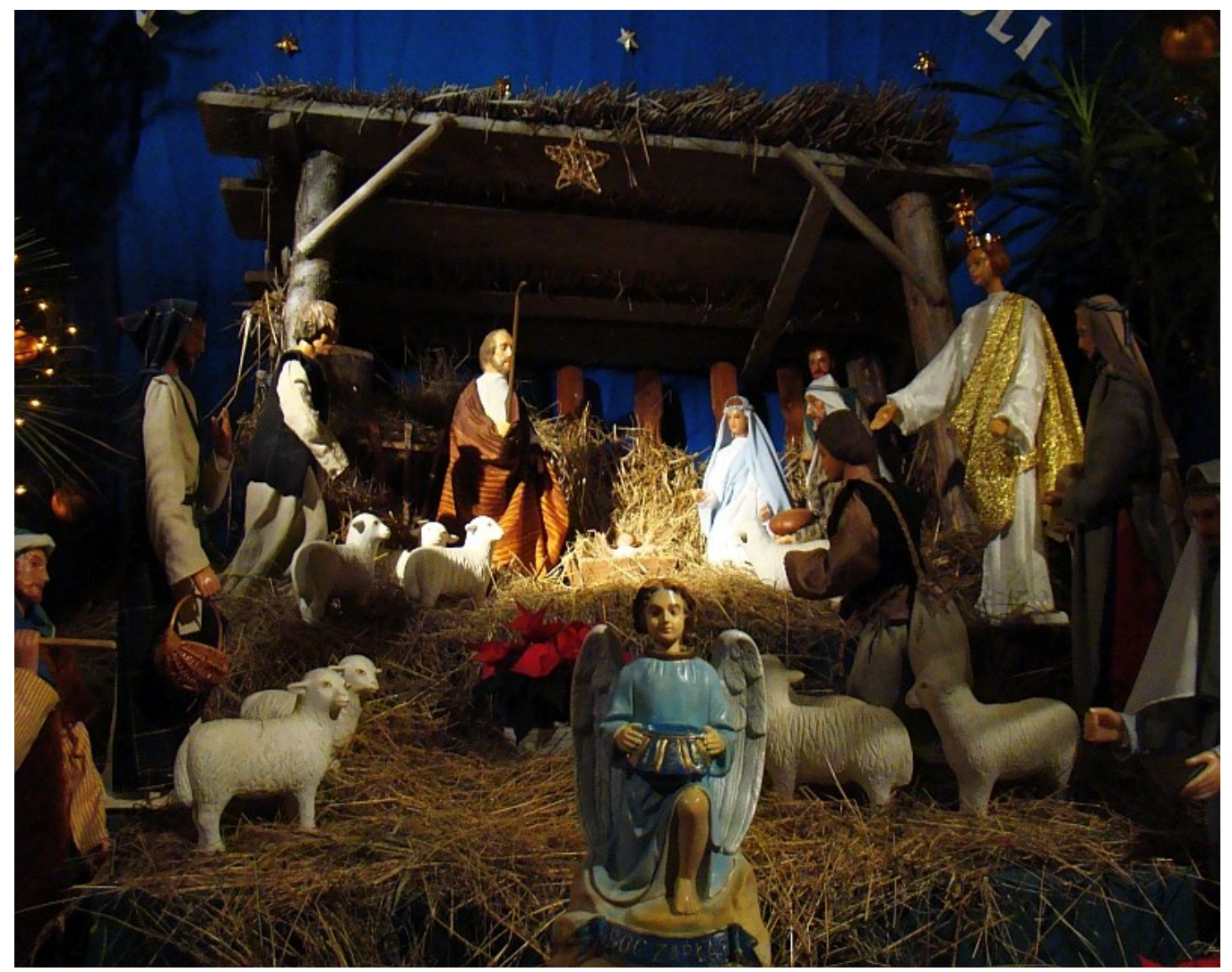
BAPTIST TABERNACLE NEWS